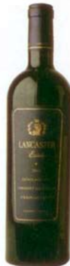
LANCASTER ESTATE, ALEXANDER VALLEY, SONOMA COUNTY (16.6)